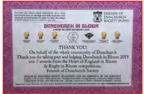
Certificate presented by FODS to the infant and junior schools

'On one of the wettest mornings of the Summer, groups from Dunchurch were out in force. The Friends of Dunchurch Society (FODS) which embraces Dunchurch in Bloom, took us around the village to meet representatives of all ages. In particular, very articulate children from the primary school acted as guides, holding signs indicating significant aspects of the village. It is difficult to imagine that last year, Dunchurch had been described as badly neglected. On judging day, even in the pouring rain, the village was