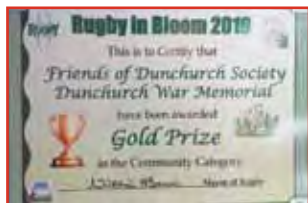
Gold Award for the War memorial

Contribution to Rugby in Bloom. Another fantastic result!