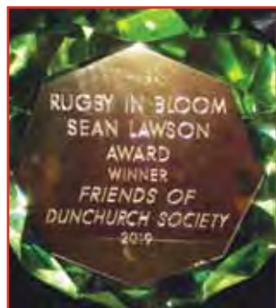
Sean Lawson Award

T he H of E awards came 'hot on the heels' of notification that Dunchurch had been awarded Gold for our Rugby in Bloom entry. Members recently attended the award ceremony at Rugby Town Hall and were surprised and delighted to find that in addition to this, we had also been awarded yet another Gold in the Community Groups category for the War Memorial which had been a joint effort between FODS and the Parish Council. Further FODS recognition followed with the presentation of the Sean Lawson Award for Outstanding