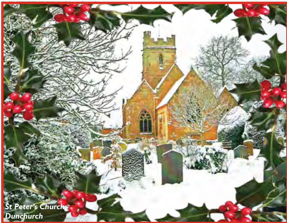
St Peter's Church Dunchurch

PRODUCED BY FRIENDS OF DUNCHURCH SOCIETY